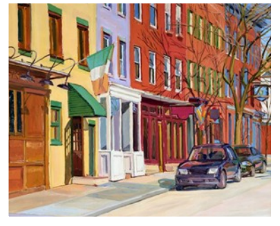
Crystal Moll Original "Looney's Pub (valued at $4,000) - Raffle Tickets on Sale Now!